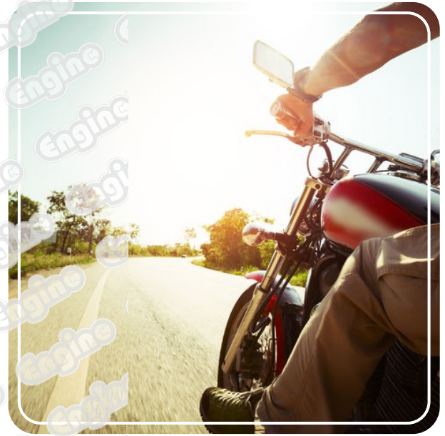
Riding on a sunny day is a joy

A motorcycle is a bike with two or three wheeled motor vehicle. A motorcycle is designed for different purposes, like for a long distance travel, and for sports including racing, cruising, off road riding and etc. Do you know the types of motorcycles? Are you familiar with the historical flashback of motorcycle? Do you know the equipment you need to ride a motorcycle? The booklet of " Motorcycles " contains a great deal of useful information and amazing facts, so that you will learn all about motorcycles. Read through the pages of this booklet to discover the types of motorcycles and the equipment you need to ride a motorcycle. Follow the bulding instructions, contained in this booklet to build exciting models such as a trial bike , an off road and scooter . Enjoy this journey of acquiring new information on different types of motorcycles.