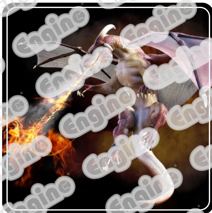
Dragons are famous for fire breathing abilities

Dragons are mythical beings, usually appearing in the mythology of several cultures around the world. There is a big diversity in their size and powers, though they have common reptilian-like features. One of their weapons is that they usually blow out fire. In countries like China and Japan big celebrations for dragons are still organised. Do you want to know more about the history of dragons? Have you wondered if dragons ever lived on Earth? Which similarities did they share among different mythologies?