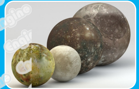
The "Galilean moons" of Jupiter

In 1610, the Italian astronomer Galileo Galilei used his telescope to discover that Jupiter had four large moons orbiting around. His discovery overturned our understanding about the bodies in our solar system. Galileo concluded that the Sun is the center of the Universe, not the Earth. Today, the four moons called Io, Europa, Ganymede and Callisto are called the "Galileans moons".