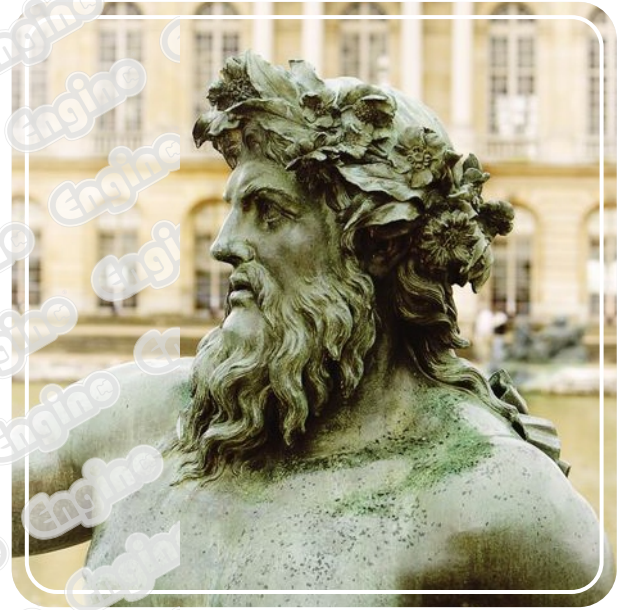
Jupiter, the King of the Planets

"Jupiter", also known as "Father of Thunder", was the king of the ancient Roman gods. He used to live on the skies and used thunders as a weapon against his enemies. Therefore, planet Jupiter gets its name after this godness, as it is the largest and heaviest planet of our solar system. Jupiter is the king of the other planets, a giant planet with shiny coloured clouds. Jupiter is the fifth planet from the Sun and it has many moons orbiting around it. It takes 11 Earth hours to make a complete circle. Do you know the characteristics of planet Jupiter? Are you familiar with Jupiter's life? Read through the pages of the booklet of " Astrophysics: Jupiter " to gain useful information and amazing facts about this planet. Follow the building instructions, contained in this booklet, to build your own Jupiter robot. Finally, take the quiz to test your newly acquired knowledge.