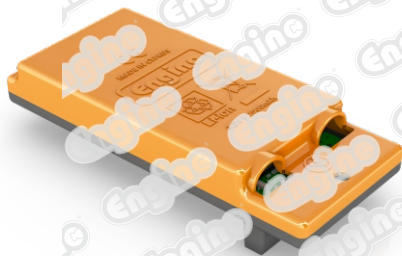
3.7V 2000mAh Li-ion Rechargeable Battery

To power on the controller you need to install the Engino® rechargeable battery on the back of the device. You will need a cross-head screw driver to remove the battery cap. The battery can be charged through the micro USB cable while having the device switched on.